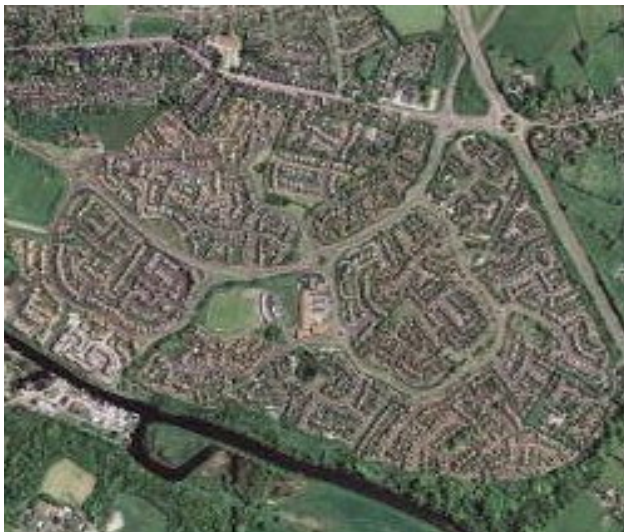
Kingsmead 2006 (Google)

If you can, look at Google maps ( http://local.google.co.uk ) and enter your postcode. You can now see up to date high definition satellite pictures of most of the parish taken last year. You can also look at these and other maps on the parish council website. There is a map of the parish boundary showing that the majority of the parish is rural agricultural land with a 'ribbon' of housing along London Road, Mere Bank at the Southern end and Kingsmead at the Northern, in all there are just over 5000 residences.